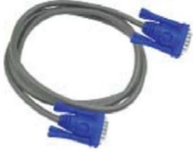
CBC-6 ■ 6ft Combo KVM cascade cable