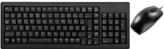
103 Key Keyboard w/ Full Size Optical 3- Button Mouse (PS2/USB)