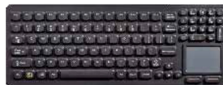
97 Key NEMA 4 Keyboard w/ 2 Button Touch-pad (PS2/USB) • Optional Red Backlight version (QB)