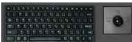
Backlit 81 Key NEMA4 Keyboard w/ 3 Button 38mm Trackball (PS2/USB)