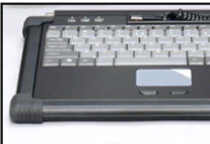
Detachable full QWERTY keyboard