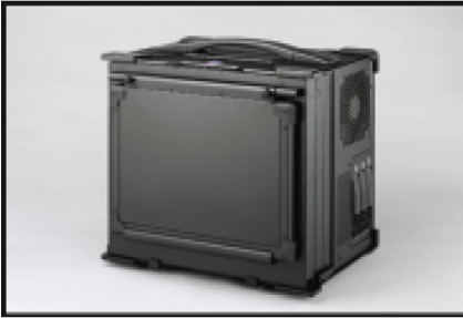
Design for portability