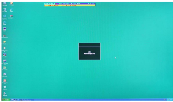
Resolution 1920 x 1200