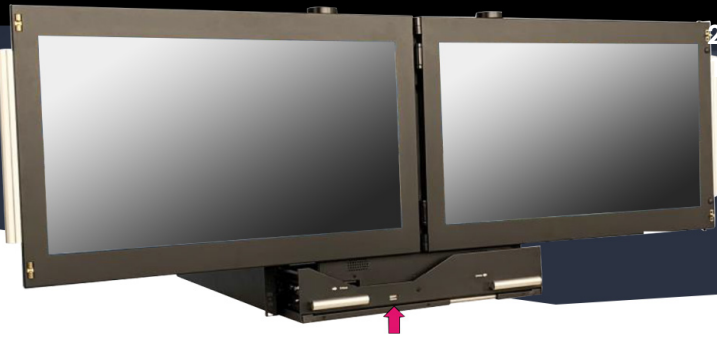
(USB Port for device access)

2U Dual 24" widescreen LCD Console Drawer Dual DVI & VGA Port, 1920 x 1080 Ultra high resolution Support FHD with 1080p resolution with 104-key keyboard with touch pad mouse USB 2.0 Keyboard & Mouse