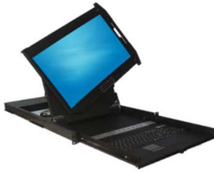
Display rotate to the right