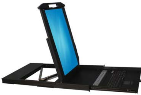
Lift the display