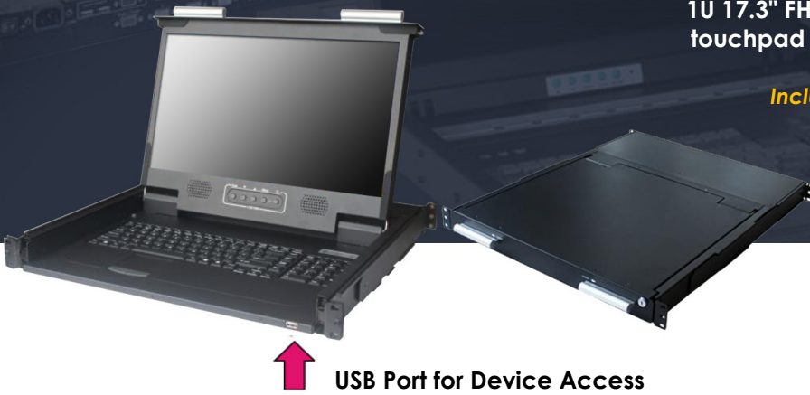
↑ USB Port for Device Access

The self-locking rails when in the fully extended open position and the ultra convenient auto lock release when the LCD panel is closed, make for simple and hassle free operation. Available with 17.3" Full HD A-Grade LCD panels, integrated 8 ports USB-DVI & Audio KVM switch. Support USB HUB 2.0 and touch screen enable function.