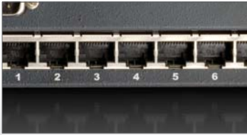
CAT5 server interface