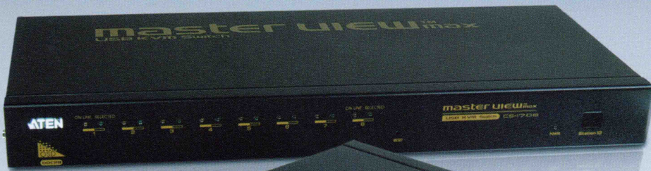
8 port (front)