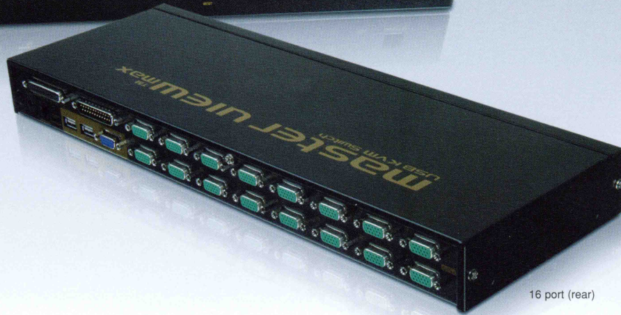
16 port (rear)