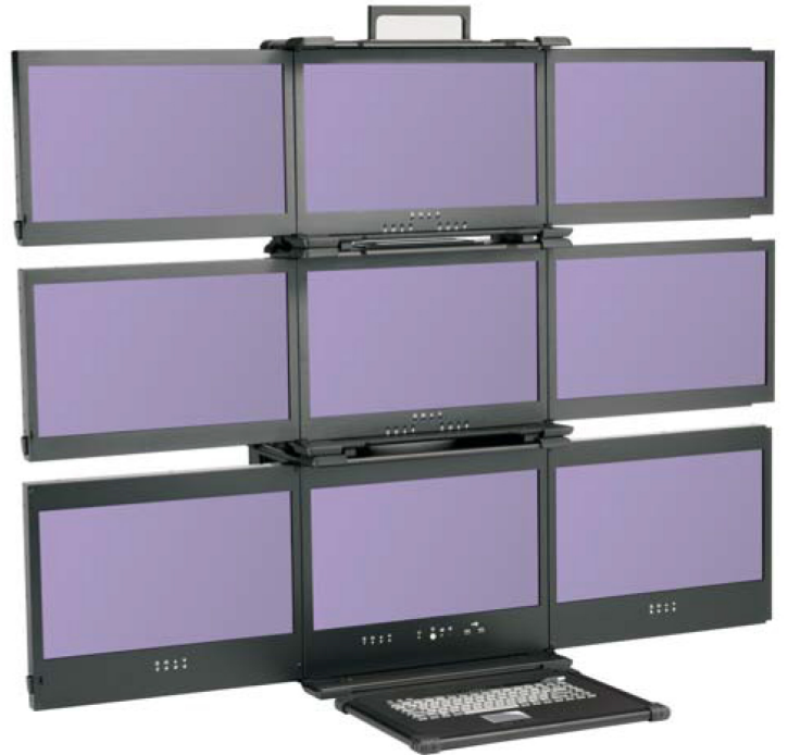
9 Displays Aggregation Portable PC Console

BPCW3D1730 x 1 (Bottom) and BDPW3D1730 x 1 (Top)