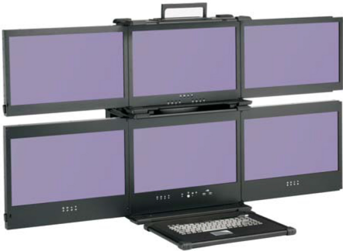
6 Displays Aggregation Portable PC Console

BPCW3D1730 x 1 (Bottom) and BDPW3D1730 x 1 (Top)