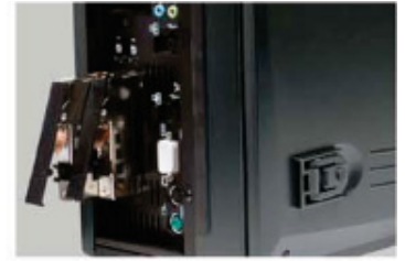
2x 2.5" SATA HDD removable bays