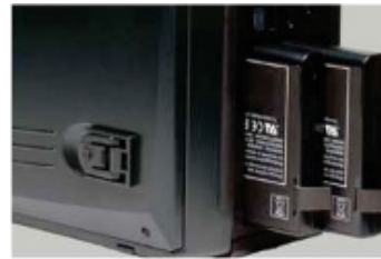
Integrated 2 high capacity Li-Ion battery packs