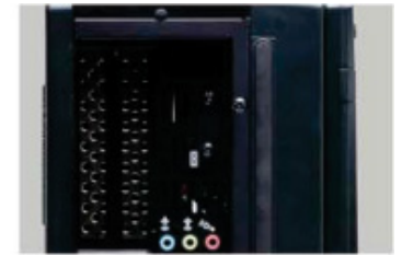
2x full length PCI slots