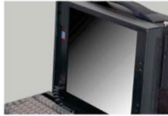
Anti-reflection tempered strengthen glass