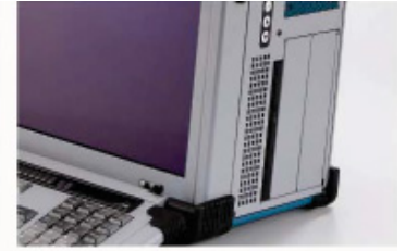
Removable 5.25" storage bays