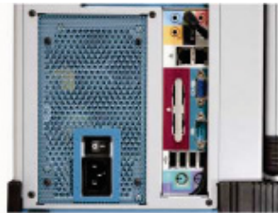
All I/O's are neatly located on left side of the unit