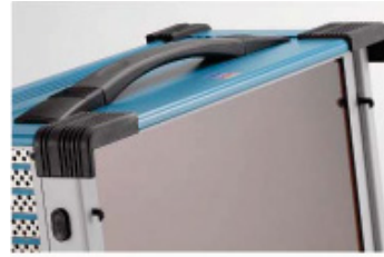
Aluminum alloy with rubber corners