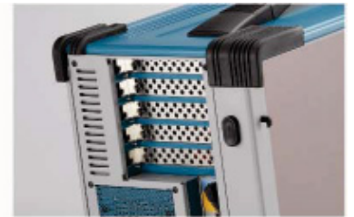
4 or 7 slots expansion capability