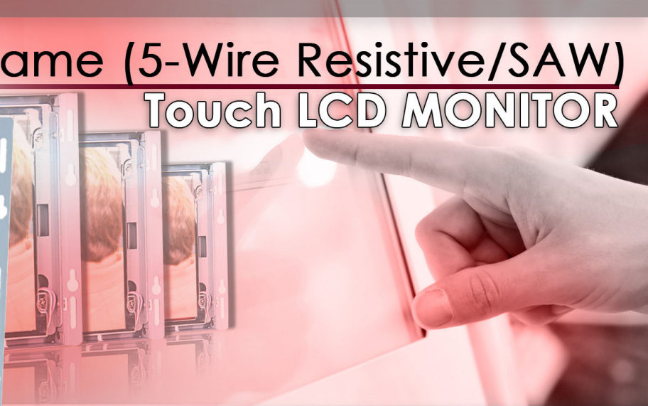
10.4" Open Frame Serial/USB Touch LCD Monitor