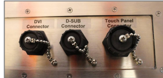
USB for touchscreen (Optional)