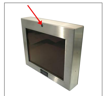
Optional for front Light Sensor for High brightness LCD