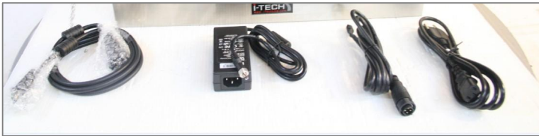
Standard external Power adapter, standard I/O Water proof cable: 1 x VGA, Power x1 6ft long