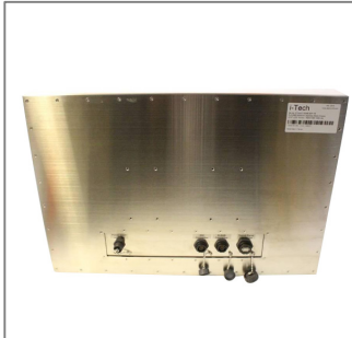
Standard VGA DVI + Power input