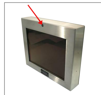
Optional for front Light Sensor for High brightness LCD