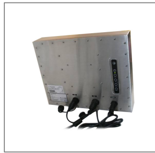
(Standard 6ft long), option for 10ft or 15ft