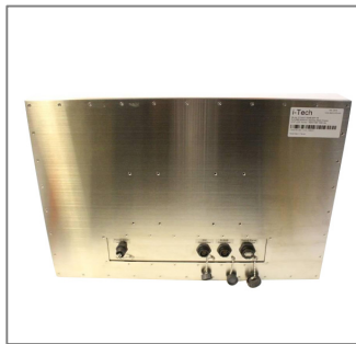
Standard VGA DVI + Power input