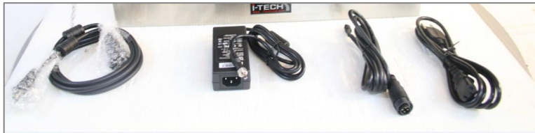
Standard external Power adapter, standard I/O Water proof cable: 1 x VGA, Power x1 6ft long