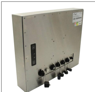
All in one PC with touch Included IP water proof connectors and cables