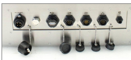
Power, USB, COM, VGA, LAN and Audio out