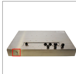
For outdoor used integrated with pressure release valve.