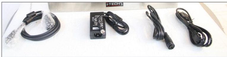
Standard external Power adapter, standard I/O Water proof cable: 1 x VGA, Power x1 6ft long