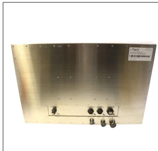
Standard VGA DVI + Power input