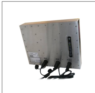
(Standard 6ft long), option for 10ft or 15ft