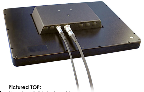
Pictured TOP: Standard DOD Series with Power and RGB Inputs.

* i-Tech's integrated NVIS options either produce near zero color shift or slight color shift for full sunlight readability. The integrated NVIS is MIL-STD-3009 compliant, and can be viewed with NVGs (Night Vision Goggles) through the entire brightness range. Dimming is not necessary to meet MIL-STD-3009, Class B NVIS requirements. Brightness levels will be reduced with the NVIS option.