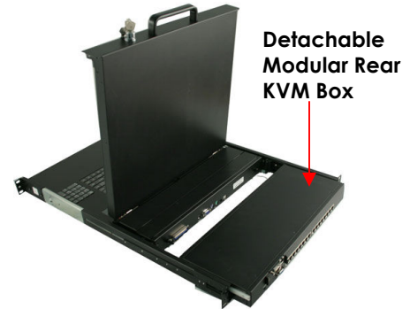
Detachable Modular Rear KVM Box