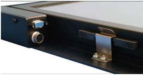
SlimLine Micro Retention Clip and Interface Connectors