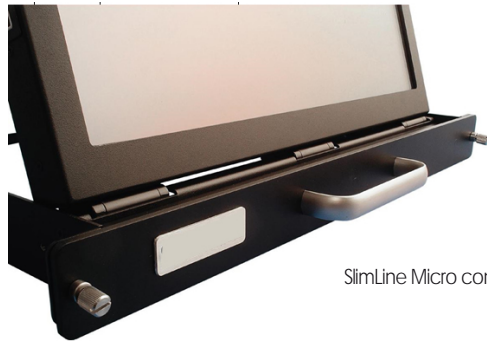
SlimLine Micro continuous friction hinge, handle and captive fasteners