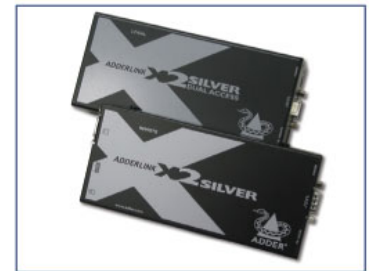
Optional KVM Extender allows monitor to be placed up to 1000' away from computer.