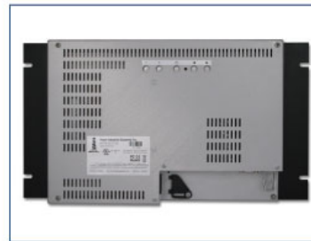
Rear view of 15" Rack Mount monitor.