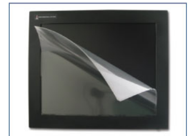
Optional Screen Protector guards touchscreens from scratches and wear.