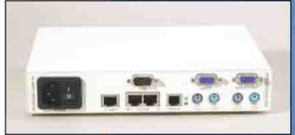
Phantom MX II Manager