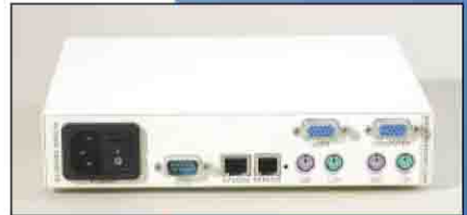
Universal Phantom Manager