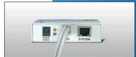
Transmitter Unit rear view