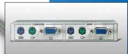
Receiver Unit rear view