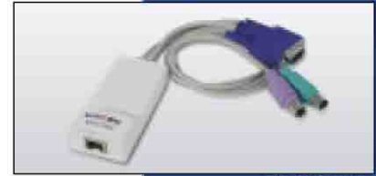
RIC PS/2 Cable (also available for SUN & USB)