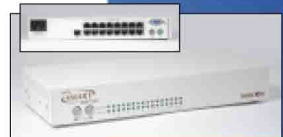
Smart CAT5 Switch, 16 Ports