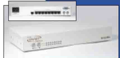
Smart CAT5 Switch, 8 Ports