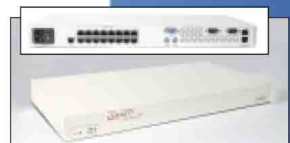
Smart 16 IP Switch