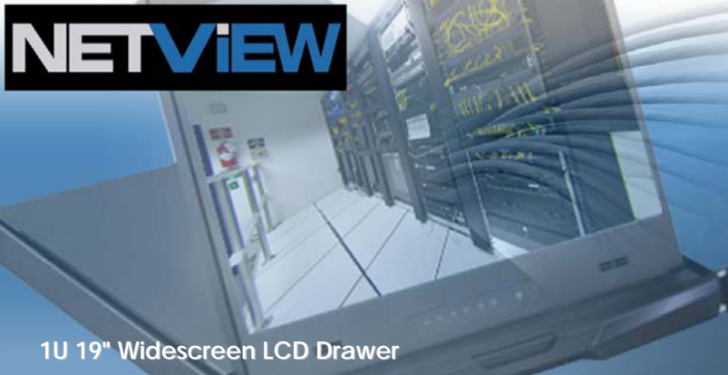
1U 19" Widescreen LCD Drawer