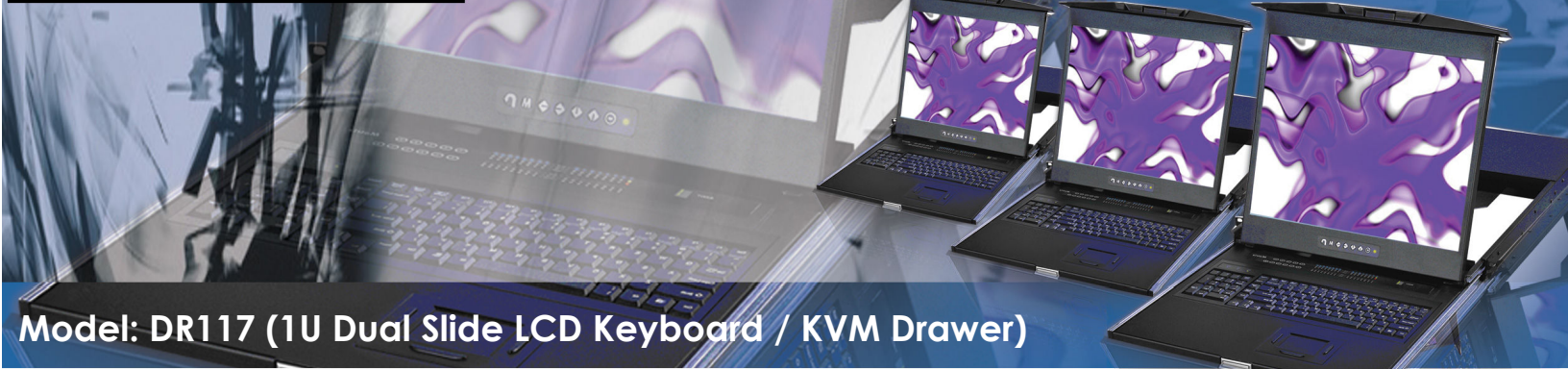
Model: DR117 (1U Dual Slide LCD Keyboard / KVM Drawer)