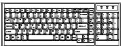
e keyboard integrated with touchpad