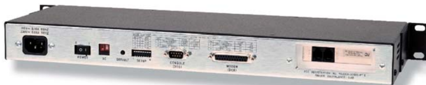
115/230 VAC Powered Unit