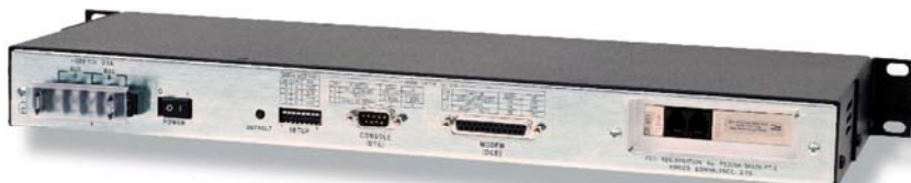
-48 VDC Powered Unit