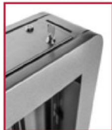
Keyed-Alike Cam Locks