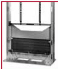
Component Tray & Shelf