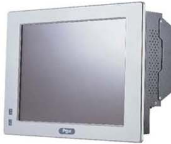
15" Panel Front View