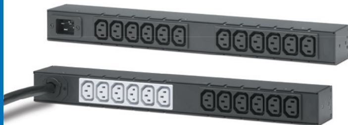
Horizontal 1U or Vertical Mounting