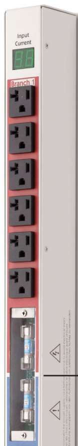
Branch Circuit Protection