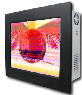
Panel Mount (5mm front bezel)

Operating Temperature : 0 deg.C to 50deg.C Operating Humidity : 30% to 90% (non condensing)