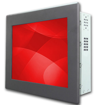
Panel Mount (5mm front bezel)

Operating Temperature : 0 deg.C to 50deg.C Operating Humidity : 30% to 90% (non condensing)