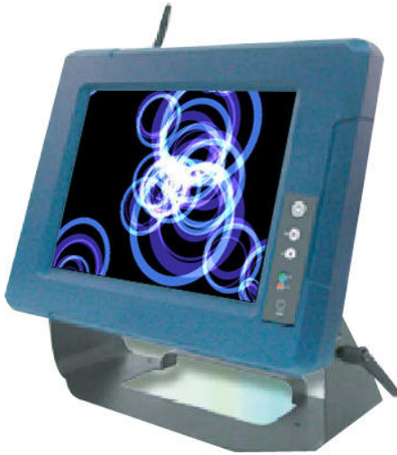
Model no.: WRDC1040P3-A