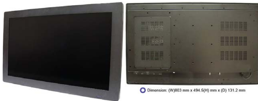
Dimension: (W)803 mm x 494.5(H) mm x (D) 131.2 mm