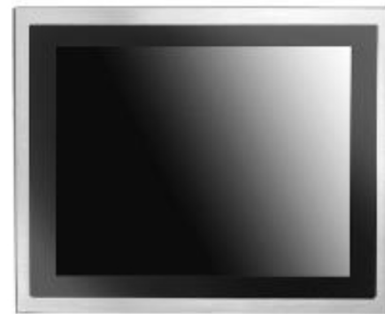
Stainless Steel Front Bezel (Option)