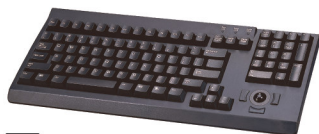
d Compact keyboard integrated with trackball