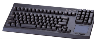
t Compact keyboard integrated with touch-pad mouse