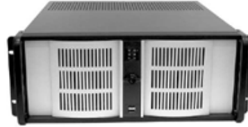
Photo of Chassis