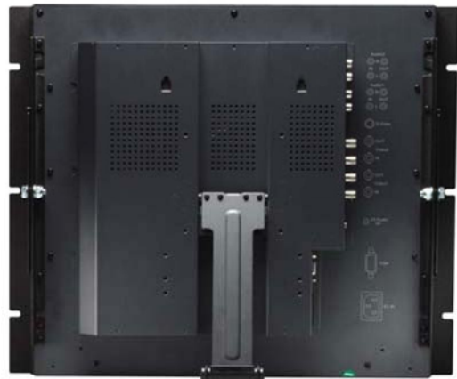
Monitor Rear View

Desk Top Mode Showing Variable Support Arm