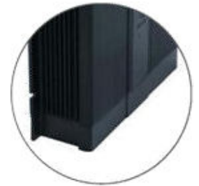
Splash Resistant Skirt