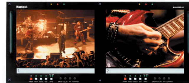
V-R102DP-2C Users Guide